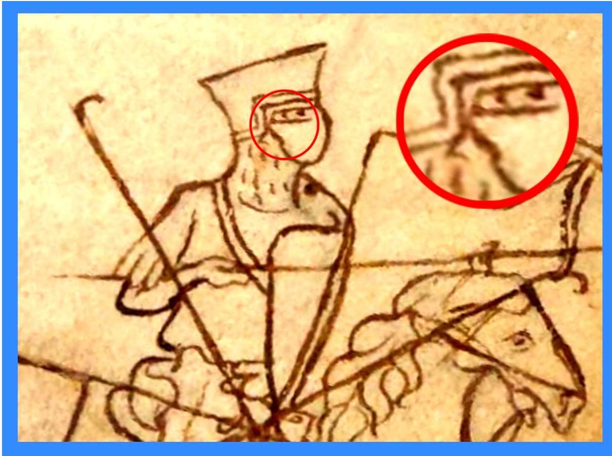
Fig 01 - Detail of the development of the nasal becoming wide that it becomes an enclosed helmet, from the manuscript 'Album de dessins et croquis'.

This helmet does not exist as an archaeological find. Therefore, it is also difficult to come up with some fixed measurements and requirements. As a blacksmith, you have to base measurement on the other two helmets, the Great Helmet which we have already made, and the Nasal Helmet which has also been ordered.