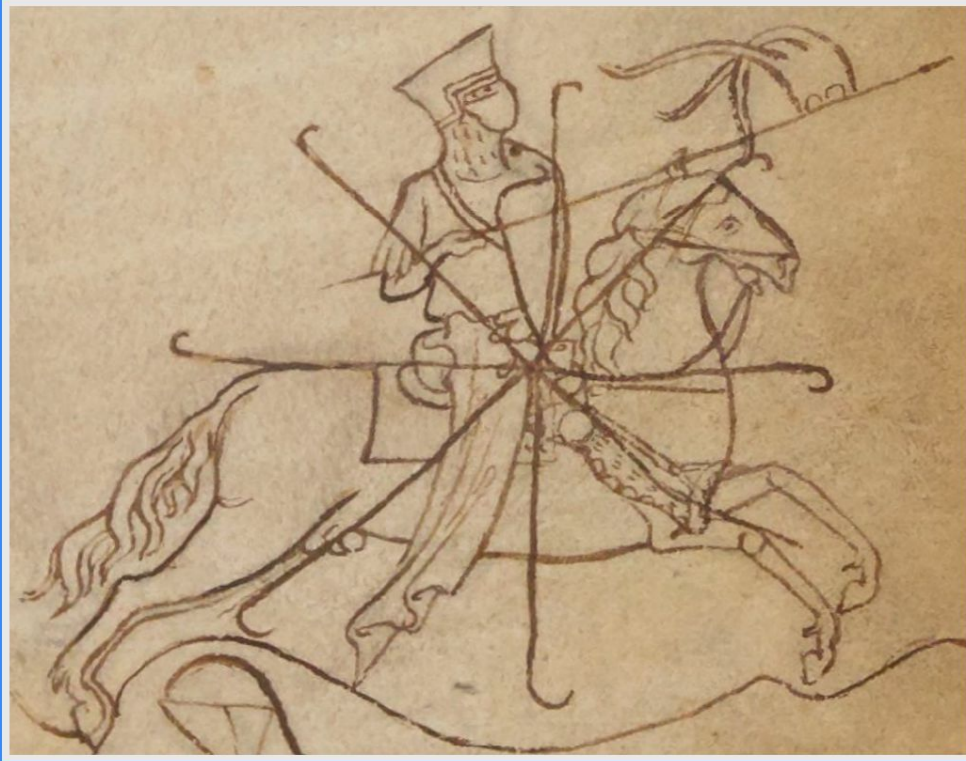
From 'Album de dessins et croquis' by Villard de Honnecourt.